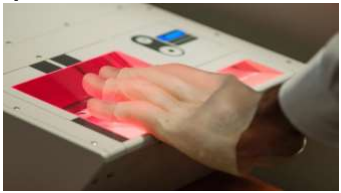
Fig 3 Biometric machine [4]

Biometrics is the technical term for body measurements and calculations. It refers to metrics related to human characteristics. Biometrics authentication is used in computer science as a form of identification and access control. It is also used to identify individuals in groups that are under surveillance.