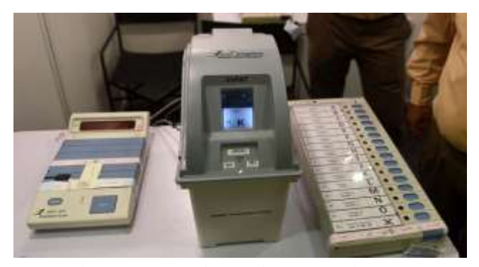
Fig 2 Electronic Voting Machine [2]

Electronic Voting is the standard means of conducting elections using Electronic Voting Machines, sometimes called " EVMs " in India. The use of EVMs and electronic voting was developed and tested by the state-owned Electronics Corporation of India and Bharat Electronics in the 1990s. They were introduced in Indian elections between 1998 and 2001, in a phased manner. The electronic voting machines have been used in all general and state assembly elections of India since 2004.