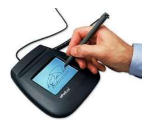
Fig 4 Signature Palette [9]

The voters will enter the polling booth with their voter board and aadhaar board to cross check their identity. After the checking process the voter's will print their impression in the biometric system. That ensures the voter and displays their details. Then they are allowed to pole. Further process is handled by the voter to select the candidate. The final process of the voting is the digital signature. This final detection is to confirm the voting process.